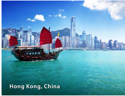
Hong Kong, China