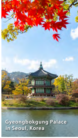
Gyeongbokgung Palace in Seoul, Korea