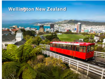
Wellington New Zealand