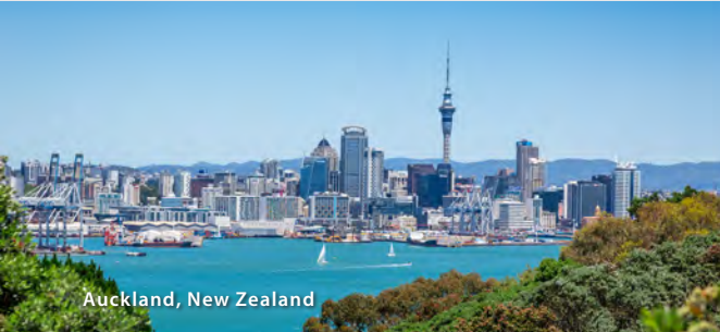
Auckland, New Zealand