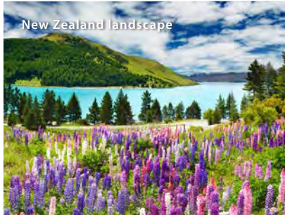
New Zealand landscape