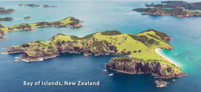
Bay of Islands, New Zealand